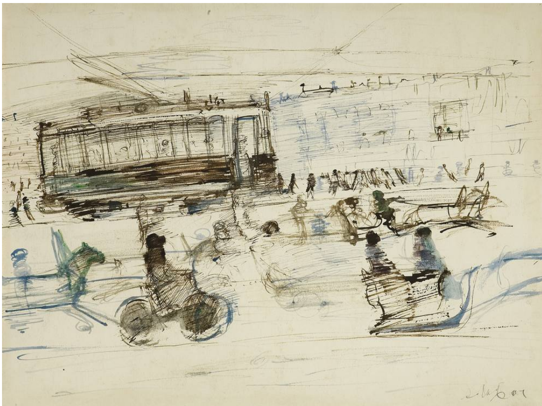
Alexander Labas. Winter in the city. 1922