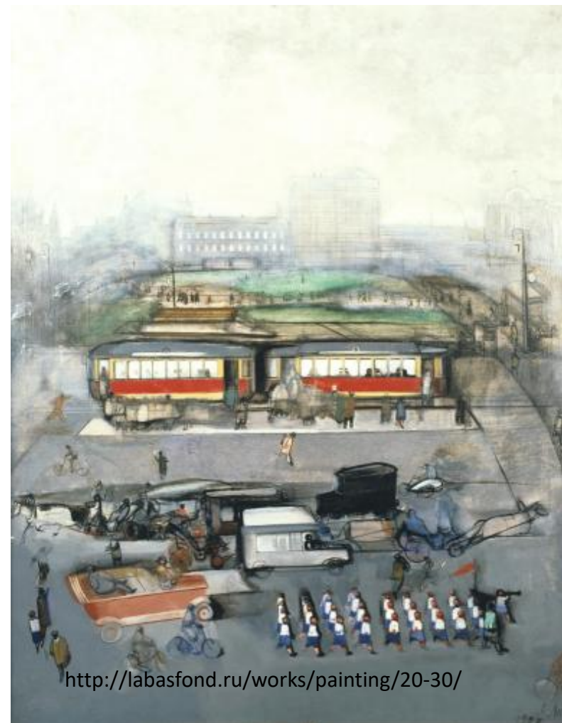
Alexander Labas. City Square. 1926

http://labasfond.ru/works/painting/20-30/