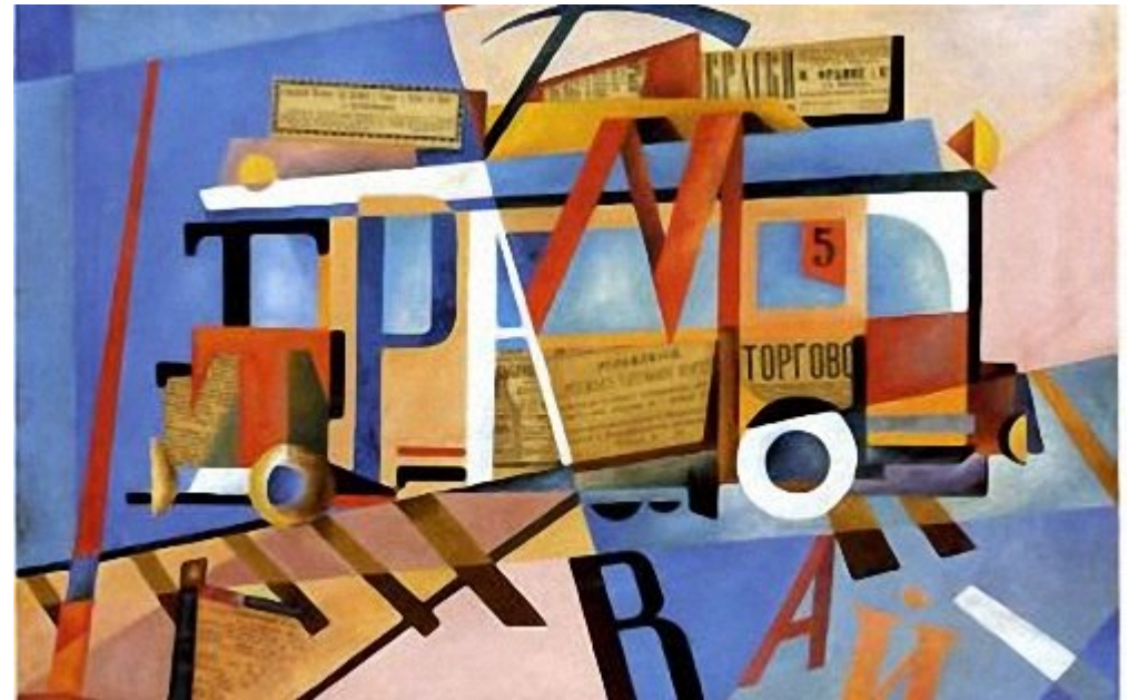
Ivan (Jean) Pougny Tram № 5. 1914-1915