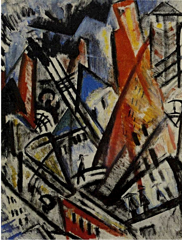
Olga Rozanova. City. 1913