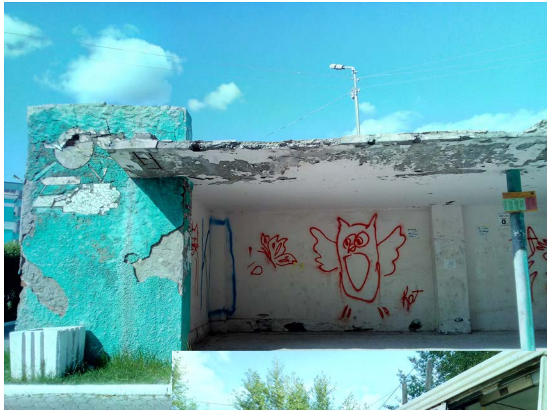
Krasnoturyinsk 2013, 2018 research photomapping